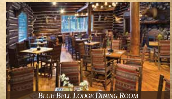
BLUE BELL LODGE DINING ROOM

Even though the Ranch House has a full kitchen, treat yourself to incredible dining. State Game Lodge, Blue Bell Lodge, Legion Lake Lodge and Sylvan Lake Lodge all have a full-service dining room that serves breakfast, lunch and dinner. Dining room menus offer a variety from deli items and burgers to seafood, buffalo and native game. For relaxing or sipping your favorite cocktail or beverage, all four lodges also have comfortable lounges.