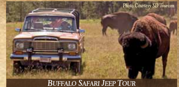
BUFFALO SAFARI JEEP TOUR

During your stay, take in all the fun recreation at Custer State Park where the fun never stops. From Buffalo Safari Jeep Rides, Hayride Chuck Wagon Cookouts, to paddle boating, mountain bike rentals, boat and water sport rentals and guided fly fishing. Get up close and see all the wild animals and birds in their natural environment. Find out more